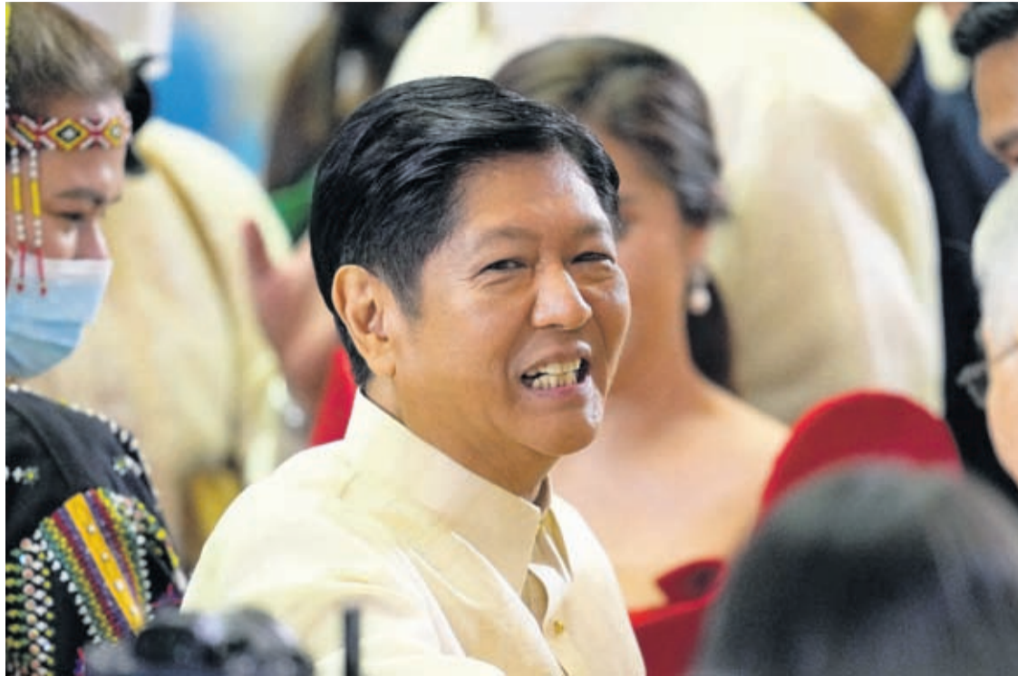
Philippine President Ferdinand Marcos Jr. smiles after he delivers his first state of the nation address in Quezon city, Philippines, Monday, July 25, 2022.

"How many times have I been here in this room where he was in consultation with different groups?"